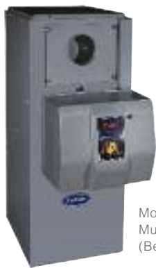
Model OVM Multi-Poise (Beckett Burner)

Industry leadership for more than 100 years doesn't happen by accident. Carrier has maintained its position and reputation through diligent, uncompromising quality control at every stage of a product's life – from concept to completion. Once our product is installed at your home, you can be confident that durable construction and built-in reliability features ensure your comfort for years to come.