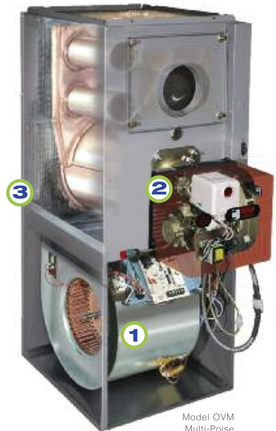
Model OVM Multi-Poise (Riello Burner)