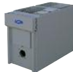
Model OVL Low-Boy

The Models OVM and CVM multi-poise are designed for versatility. With the ability to install in upflow, downflow and horizontal right and left applications, this proven performer is an excellent fit for virtually any home.