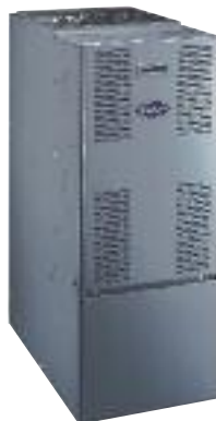
Model CVM Multi-Poise