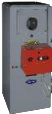
Model OVM Multi-Poise (Riello Burner)